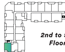
2nd to 5th Floor