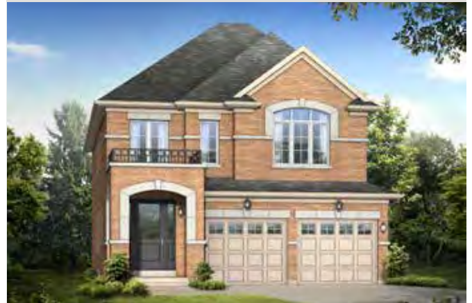
40' SINGLES FROM OVER $1.2 MILLION