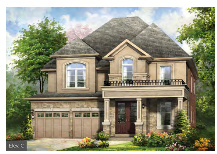
EMELINE Elev. C

Located just north of Brampton at Mayfield Road and McLaughlin Road, the Mayfield Collection features Rosehaven's signature designs in 30′, 38′, 41′ and 45′ single detached homes starting from the upper $1.3million.